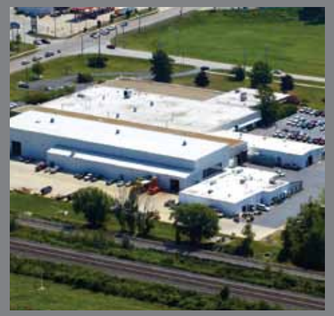
Eriez World Headquarters