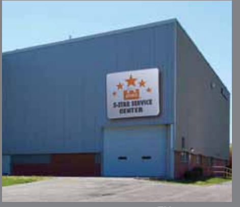
Eriez 5-Star Service™ Center