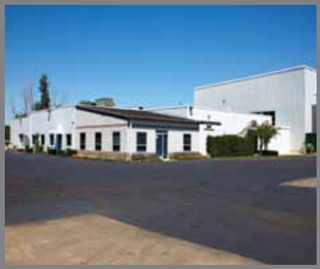
Eriez Technical Center